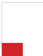
Eighth Page 3.825" x 2.375"