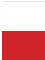
Half Page Horizontal 7.875" x 5"